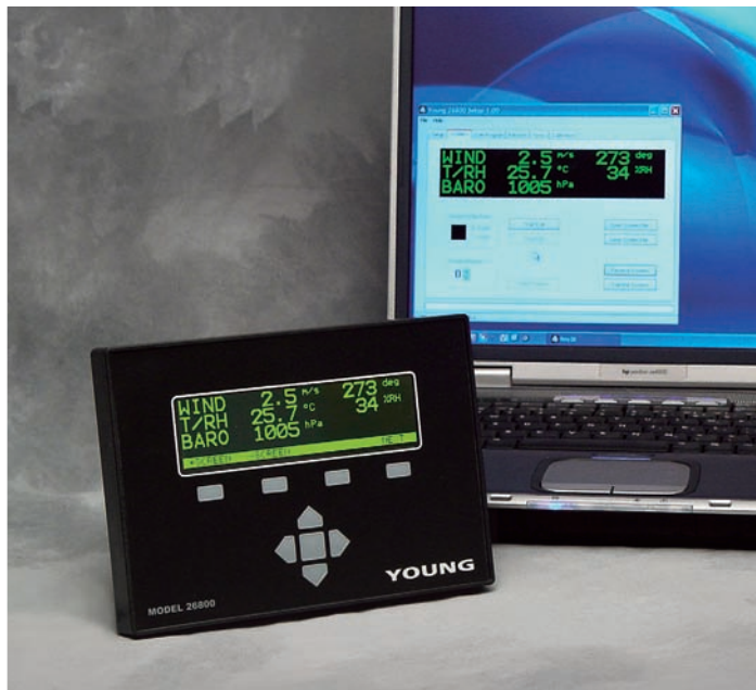
26800 Translator with PC setup program.

2,162,688 Single-precision floating point values for data records. 256 Temporary floating point values for User Program 1 to 512 User Program Instructions