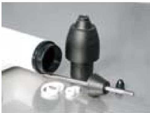
Ceramic bearings are long-lasting and corrosion resistant